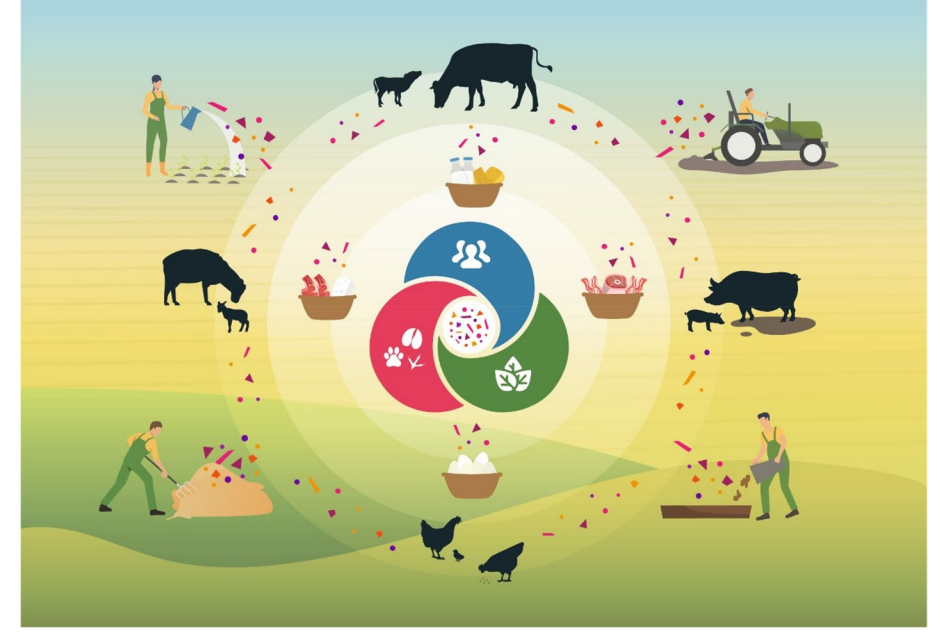
Fig. 1 Farm animals form a critical link in the plastic particle cycle. Plastic debris, including MNPs, originating from human activities, inadequate waste management and environmental conditions, is accumulating in the agricultural environment and enters farm animals through the uptake of MNP contaminated food sources and water. MNP uptake forms a potential risk for the health of farm animals and may result in MNP transfer to humans via animal-derived food products, which may potentially impact human health. MNPs are in the figure represented by particles with different shapes and colours

increasing levels of MNPs, and the mechanisms of toxicity, such as immunomodulation, DNA damage, and oxidative stress, are frequently conserved across species. Up until now, however, farm animals have largely been overlooked in the One Health approach to MNP research. Farm animals are both consumers and distributors of MNPs via animal-derived food products like milk, meat, and eggs for human consumption. The impact of MNPs on farm animals exposed to MNPs, which is impossible to avoid given the increasing load of plastics in the environment, may also extend to adverse effects on their health, including their ability to reproduce. As such, farm animals may serve as indicators of potential health hazards of MNP exposure in humans. The aim of this concise perspective paper is to signal the importance of farm animals as a critical link between environmental and human health impacts of MNPs (see Textbox and Fig. 1). To this end, we briefly summarize emerging evidence for sources of MNPs on the farm, exposure routes and levels of MNPs and potential health effects of MNPs in farm animals. We highlight the importance of better characterizing the occurrence and distribution of plastics on farms from feed and environment to animal, and humans via animal-derived food products, emphasizing a One Health approach. Finally, based on this synthesis, we describe